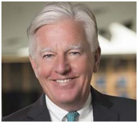
Marty Meehan University of Massachusetts System Board Member